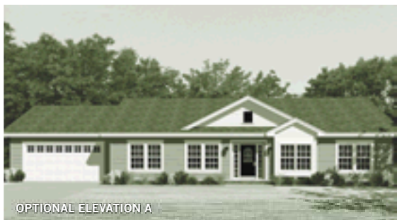
OPTIONAL ELEVATION A