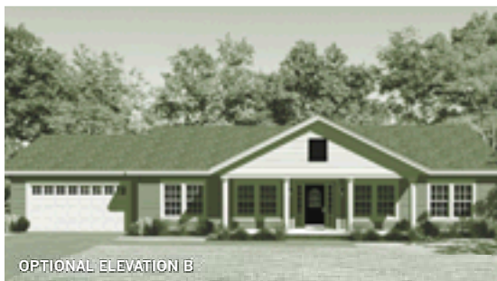
OPTIONAL ELEVATION B

* Elevation choices may affect home price and may vary by region.